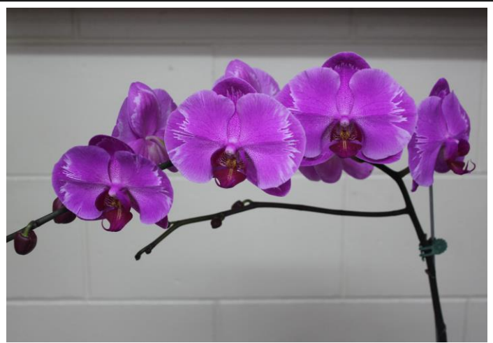
ABOVE: TOWNSVILLE ORCHID SOCIETY WINTER SHOW RESERVE CHAMPION: